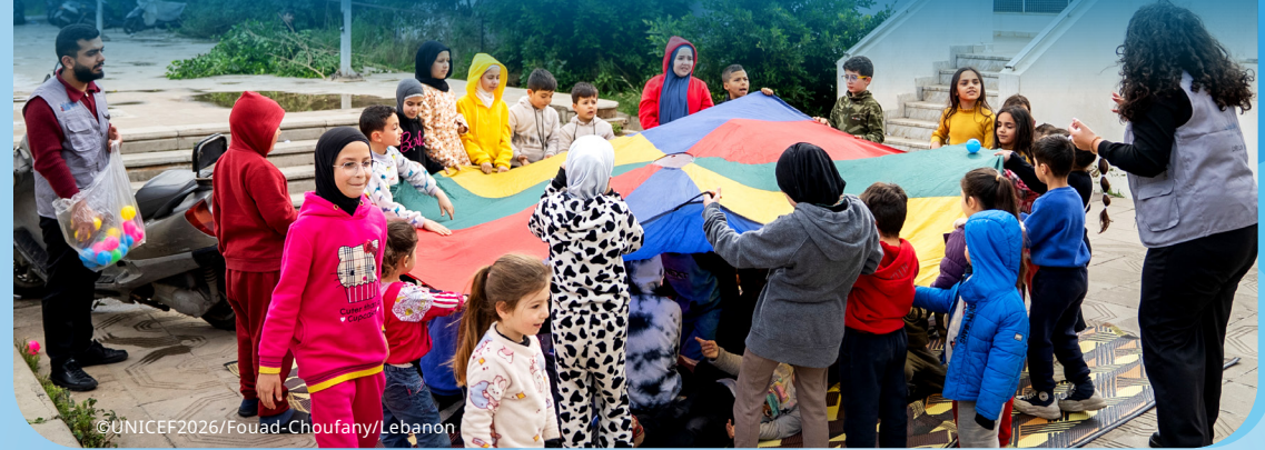
Children play at the UNICEF-supported Bir Hassan TVET shelter in Beirut, home to thousands of families who fled recent violence.

The fate of over 200 million children caught in violence, disasters, famine, climate shocks and crises hangs precariously in the balance. Yet despite the challenges, hope still shines through.